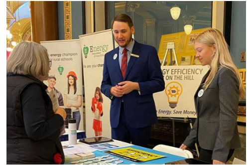
IEC Staff at Energy Efficiency Day on the Hill.

This Wednesday the energy team is excited to be a part of Solar Day on the Hill, highlighting solar's contributions to Iowa's economy and advocating for extension and expansion of Iowa's solar investment tax credit. We continue to work with MidAmerican toward a potential solution on net metering that will offer long-term certainty to solar customers and the industry, though we have yet to reach a final agreement.