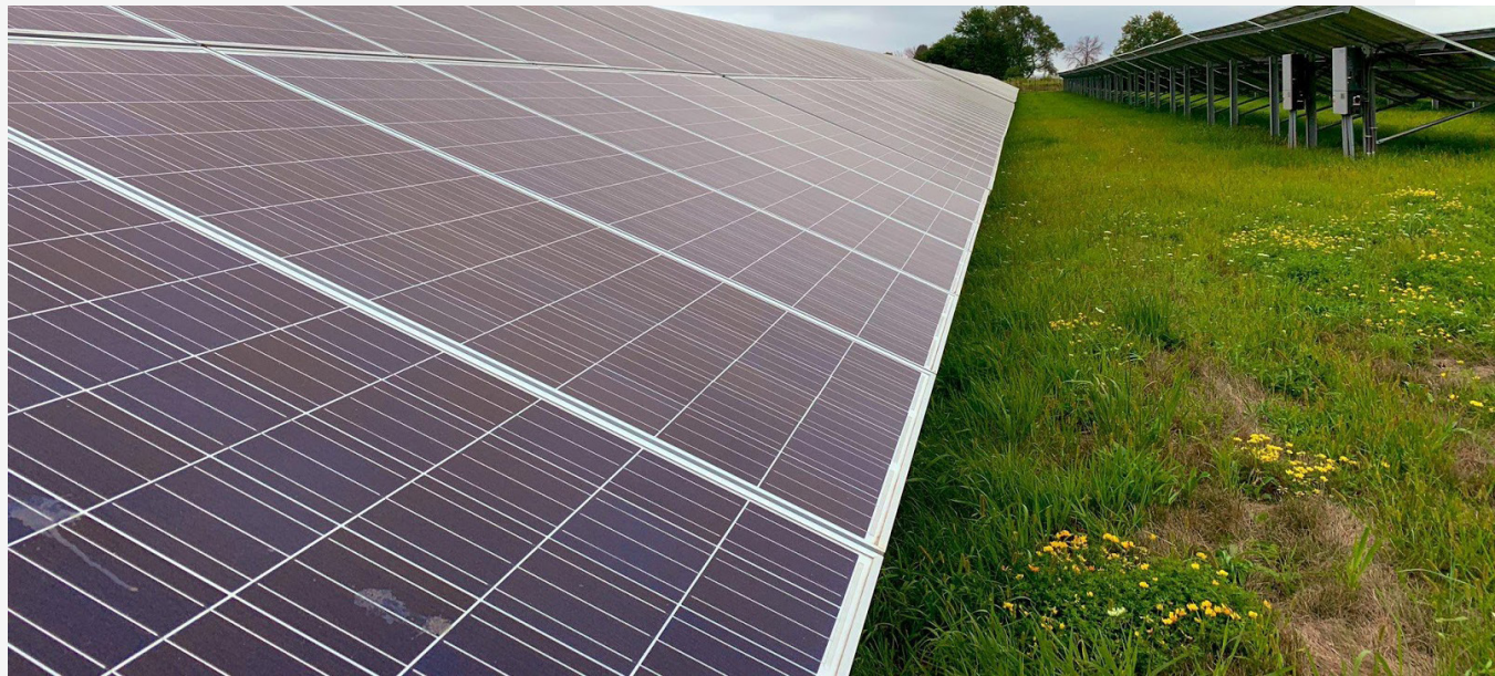
City of Cedar Falls community solar project.

Typically, community solar projects incorporate methods for community members to participate in the project in some way through a mechanism such as an investment or subscription with the benefits of the project passed along to subscribers. Some considerations for community solar projects are listed below.