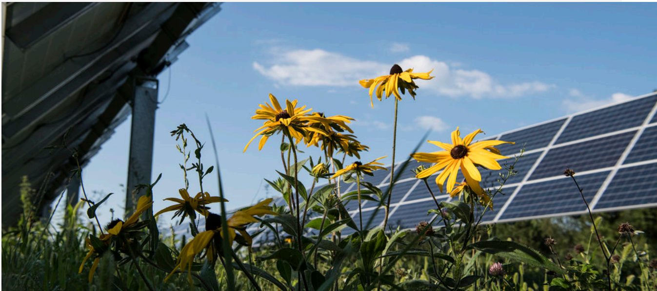
Native prairie plants at the Chisago Solar Site, Chisago County, Minnesota, August 2018.

Historically, there were 28 million acres of native prairie across the state of Iowa; there is less than one-tenth of one percent of that native prairie remaining. Investments in native vegetation on solar project sites can also help restore habitat for wildlife like ring-necked pheasants, quails, and other grassland birds such as the dickcissel or the sedge wren.